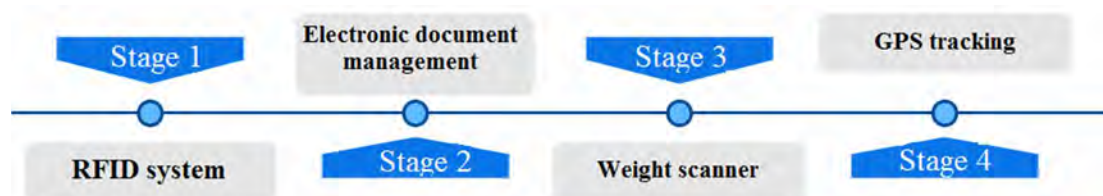
Fig. 3. The sequence of implementation of digital technologies at “UKR Logist” Ltd

Therefore, it is necessary to implement the RFID system first, then to organize the application of the electronic document management system, then start using scanner scales and launch GPS system (Fig. 3).