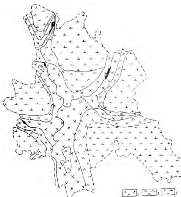
Fig. 2. Scheme of zoning of the territory of Kharkiv under flood conditions: 1 – flooded territories; 2 – potentially unsinkable territories; 3 – potentially flooded territories (according to [20])

Table 2 presents the factors of flooding and their values and the cost of engineering measures to eliminate their causes and consequences.