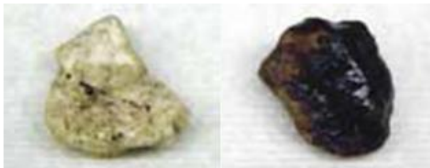
Fig. 2. Limestone after 1 hour soaking in bitumen emulsions and rinsed with water. Emulsion on hydrochloric acid (to the left) or emulsion on ortho-phosphoric acid (to the right) (AkzoNobel, 2012).

The emulsifiers for rapid-setting emulsions on the basis of “diamine” can be used with acetic acid, although this choice in the USA can be narrowed due to the requirements of normative documents. Water phase pH shall be adjusted till 3-4, while emulsifier dosage shall be increased by 10–20 % to provide for reactivity, comparable with that one of the hydrochloric acid. The application of ortho-phosphoric acid can improve the reactivity of limestone. (Fig. 2).