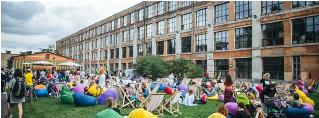
Fig 1. Art plant «Platform», open air space. [7]

Art clusters in Ukraine arose quite recently, largely due to the process of European integration and modernization. They are located in Kyiv. At present, such clusters are well known: art plant "Platform", "Vydubychi", "Dovzhenko Center", etc. The most visited among them is the art factory "Platform" - the largest creative cluster in Ukraine, located on the Left Bank of Kyiv. The space is located on the territory of the Darnytsky Silk Factory and combines business, festivals, coworking, art, fashion and other creative industries. Since 2014, it has been visited by about two million people, and the business community brings together more than 300 different startups and innovative projects. The main goals of the cluster are the development of Ukraine and the support of talented youth. It can be said that art clusters as new forms of artistic and social practices, can integrate into the "traditional" urban space.