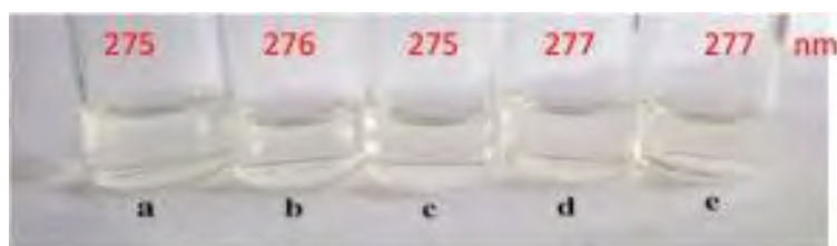
Fig. 3. Photos of NBP after UV exposure for different times (h):1 (a), 2 (b), 3 (c), 6 (d) and 12 (e). The UV absorbance maximum of each sample is showed in the upper series

Next, the stability of the proposed NBP was further assessed using UV radiation (Fig. 3). Qualitative and quantitative methods were used to analyse the stability of the nanoencapsulation neem seed extract with chitosan modified with succinic anhydride against UV radiation. The qualitatively visually observed changes are shown in Fig. 3. As seen, the NBP is stable against UV radiation because its turbidity or colour did not change. The same result was also found for the nanoencapsulation of neem seed extract without modification.