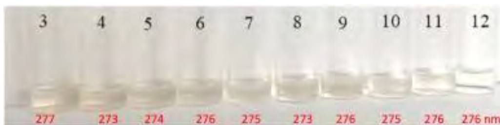
Fig. 1. Photos of NBP under various pH ranges (from pH 3 to pH 12). The UV absorbance maximum of each sample is showed in the lower series

The stability of the proposed NBP under various temperatures was also assessed. The results (Fig. 2) of the nanoencapsulation neem seed extracts with a temperature treatment show that the colour or the turbidity of the extracts did not change (based on each UV maximum absorbance). It can be concluded that nanoencapsulation neem seed extracts with chitosan modified with succinic anhydride can survive in an environment with temperatures ranging from 303 to 333 K. These data prove that the NBP meets the requirements for agricultural application (average temperature 308–323K).