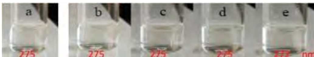
Fig. 2. Photos of NBP under various temperatures: at room temperature (a), 303 K (b), 313 K(c), 323 K(d) and 333 K (e). The UV absorbance maximum of each sample is showed in the lower series