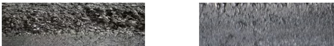
Fig. 3. Photos of two electrode billets with a diameter of 400 mm impregnated with a modified pitch