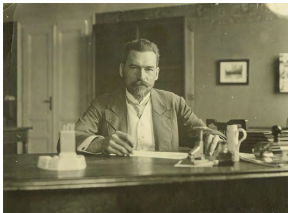
Fig. 1. Marian Smoluchowski at his desk. At present, we cannot confirm whether this photo was taken in Lviv (cf. [17]) or in Kraków.

Marian SMOLUCHOWSKI (Maryan Ritter von Smolan Smoluchowski, *28 May 1872 – †05 September 1917) was born in Vorder-Brühl (presently a part of Mödling, a suburb of Vienna). In 1890, he finished the Collegium Theresianum, where in particular he made acquaintance with Kazimierz Twardowski (1866–1938). During 1890–94, Marian Smoluchowski studied physics at the University of Vienna. After accomplishing military service in 1894–95, he received his doctoral degree in 1895 for the work Akustische Untersuchungen über die Elasticität weicher Körper [ Acoustic studies of the elasticity of soft bodies ] [11]. Often, Jožef Stefan is mentioned as Smoluchowski’s advisor [4, 12, 13]. However, according to the information obtained from the Archive of the University of Vienna, his doctoral advisors were Franz Exner (1849–1926) and Viktor von Lang (1838–1921), cf. also [14, 15].