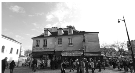
Fig. 4. Archaic legendary structure, Montmartre in Paris.

In this sense, the strategy of legendary structure acts as a three-component system of views consisting of archaic level – finding and updating of historical, symbolic, and religious aspects.