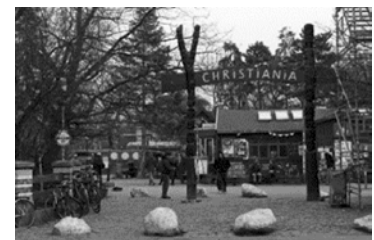
Fig. 6. Communicative legendary structure, Christiania in Copenhagen, [14]