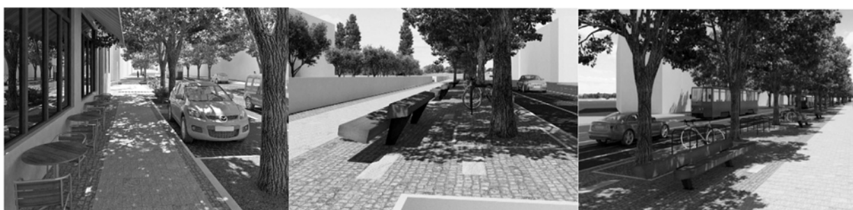
Fig. 3. Project proposals for the reconstruction of the Bandera street, project of 2017, [9].

Thus, for the construction of city-transforming impulses for the development of a post-industrial city, the universal factors of the rapid growth of urban fabrics, should be divided into two parts. One of them can be