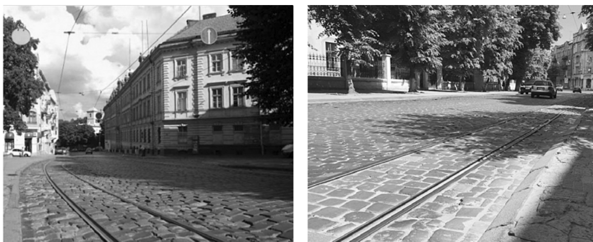
Fig. 2. The present condition of the road surface from the pavement side, Bandera street, 2018, [9]

If such competition was restricted from radical forms of confrontation and limited to the non-aggressive manifestations, the motivational quality of the 'legendary' factor could be a source of additional growth of the city's activity. However the motivational factor can act most effectively in the case of opposition to the city structure. Such an opposition is already an important element of the city-wide discourse around important issues of its infrastructure development (for example, discussions around the reconstruction of Bandera Street in Lviv in 2016–2017, when all the participants turned to examples of a competing for a “different” city –the one without a cobblestone and the one where it is partly preserved).