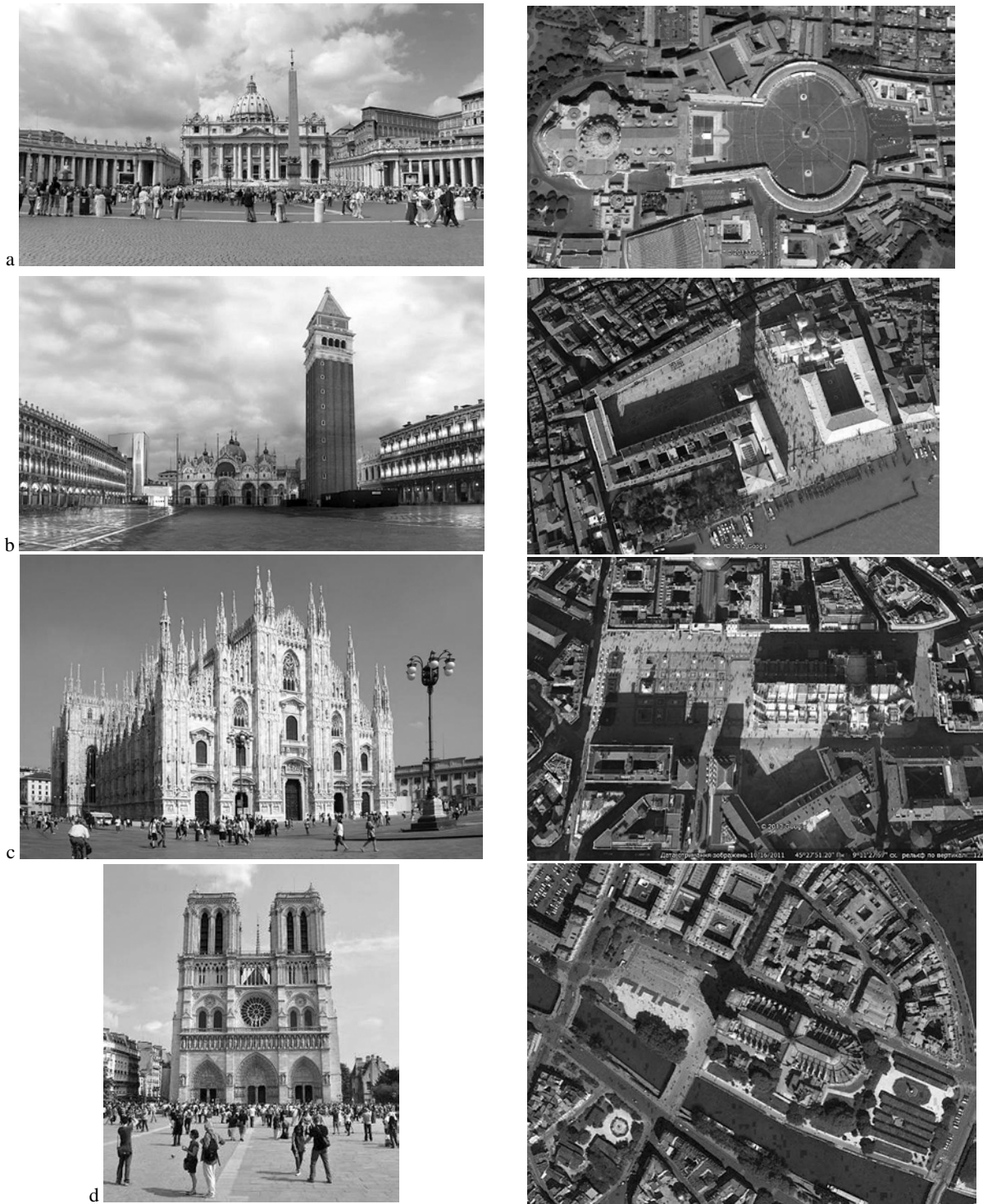
Fig. 4. Examples of sacred squares arrangement: a – the Cathedral of St. Peter in Rome; b – the Cathedral of St. Mark in Venice; c – the Cathedral of Milan; d – the Cathedral of Our Lady of Paris.

If we analyze the most magnificent churches in Europe: the Cathedral of St. Peter in Rome, the Cathedral of St. Mark in Venice, the Cathedral of Milan, the Cathedral of Our Lady of Paris, etc., it should be noted that the sacral space of their squares is resolved flawlessly from an aesthetic point of view and enhances the greatness and the weight of the temple. According to the theory of vision, for the best perception of the object of architecture, it is necessary to provide an optimal vertical angle of 27 degrees view (that is a distance equal to two heights of the object) (Koznarska, 2014). Actually, these principles, in this case, are clearly elaborated, therefore, in front of the main facade there is an elongated square from which you can examine all the greatness of architecture (Fig. 4).