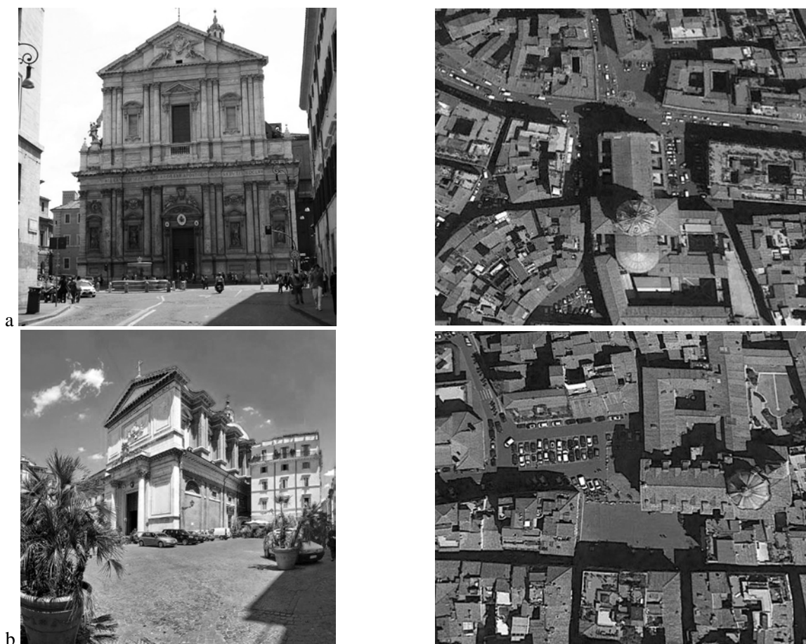
Fig. 1. Examples of sacred squares arrangement: a – Church of St. Julian of the Flemings; b – Church of San Salvatore in Lauro

The experience of Italy, where the warm climate and dense urban development patterns are predominant is worth mentioning here. For example, in Rome, at the end of the nineteenth century, there are 255 churches and 21 of them are attached on one side; 96 – attached on both sides; 110 are attached on three sides; 2 attached on four sides and only 6 are free standing ones (Sitte, 1889). This arrangement of objects of sacred architecture has proved itself as the one having more positive features of their perception by the viewers. The church view is opened only from the “correct” side, creating a unique perception pattern. These visually limited areas provide an opportunity to focus on spiritual qualities: Church of St. Julian of the Flemings; Church of San Salvatore in Lauro; Church of Santa Maria Maddalena (Fig. 1). And the Church of Sant'Ivo alla Sapienza can only be seen from the courtyard (Fig. 2).