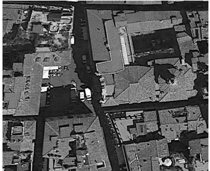
Fig. 1. Examples of sacred squares arrangement: c – Church of Santa Maria Maddalena.