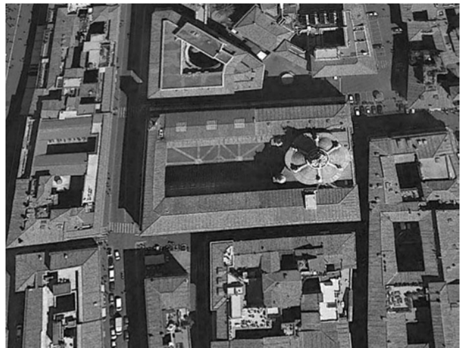
Fig. 2. Church of Sant'Ivo alla Sapienza and the courtyard.

The arrangement of the area not along the main axis but perpendicular to the axis of the church offers a spectacular view of the site. In this case, we have the opportunity to observe the main facade only at a certain angle: the church Sant'Agnese in Agone, which looks on Piazza Navona (Fig. 3).