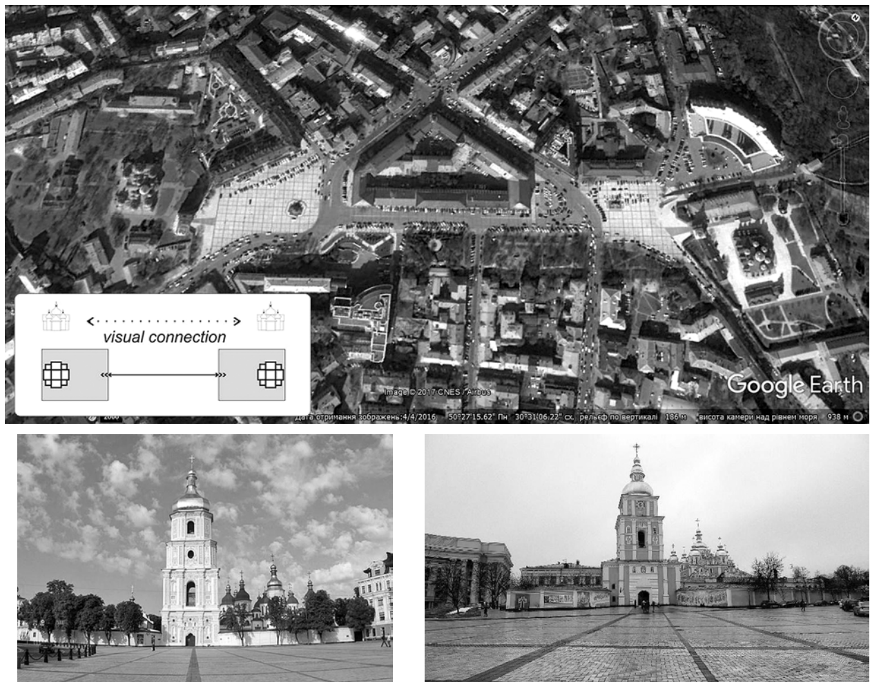
Fig. 5. Organization of the sacred space of St. Sophia Cathedral and St. Michael's Golden-domed Monastery in Kyiv.

While forming the spatial structure of historical cities, the streets were laid in the direction to its dominants – the sacral objects. Thus, the facades of the surrounding buildings create a foreground that led the viewer's sight to the temple, thereby enhancing its significance, and the street gains a compositional perfection (Koznarska, 2011). Combination of several sacral spaces into a single compositional structure provides a sound basis for shaping the image of the city. Thus, the image of Kyiv is formed on the basis of a sacral center which includes two sacral complexes: the St. Sophia Cathedral and the St. Michael's Golden-domed monastery, the sacral squares of which are connected by Volodymyrsky Avenue (Fig. 5).