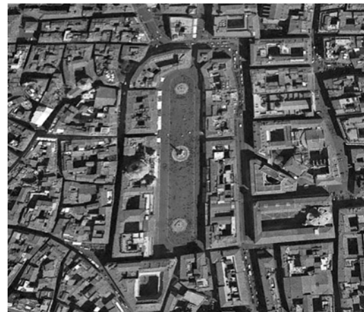
Fig. 3. The church Sant'Agnese in Agone and Piazza Navona.