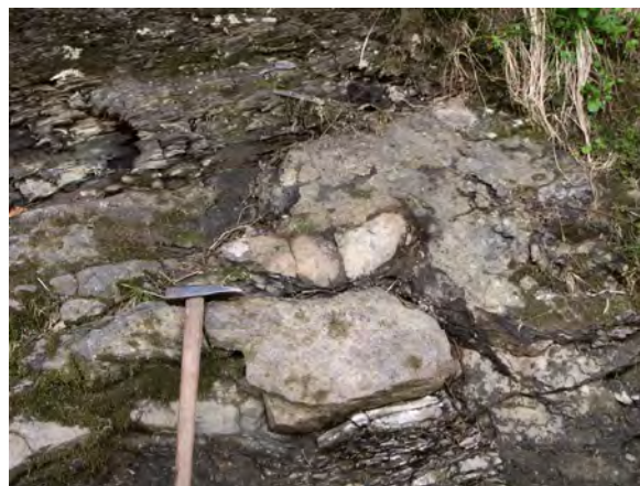
Fig. 5. The lens of the debris-flow deposits among the fine-grained turbidites in the Upper Member of the Soimy Formation, Silesian Nappe, Smozhe Structure. Stryi River, beneath the village of Klymets

The Middle Member (thickness ~350–400 m) is composed of thick-bedded different-sized sandstones, of which some are gravelites. It is characterized by massive and pudding-like textures that suggest its sedimentation by the grain- and high-density turbidity flows.