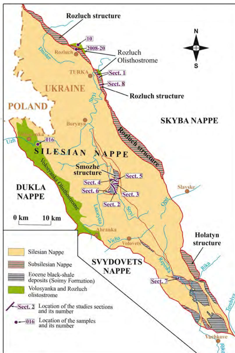
Fig. 2. Location of the studied sections and samples on the scheme of the Silesian and Subsilesian nappes. Figure location see Fig. 1A

various researchers [Glushko & Kruglov, 1971; Byzova & Beer, 1974; Glushchenko et al., 1980; Vialov et al., 1981; Kuzovenko, 2003; Picha & Golonka, 2005; Hnylko, 2010 and references therein].