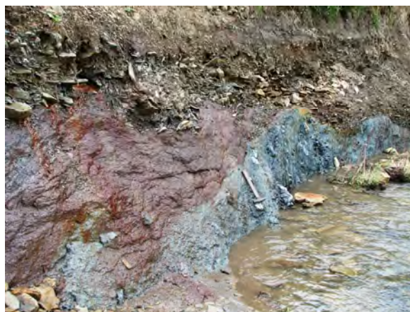
Fig. 6. Olistolith (to the left) of the destructured red clay-marl sediments in the olistostromic matrix composed of debris-flow deposits (to the right). Rozluch olistostrome, Yasenytsia River, 600 m below the mineral spring in the village of Rozluch

Rozluch Olistostrome is developed in the Stryi and Dnister river basins near the Rozluch Structure in front of the SubSilesian Nappe, likely in the back part of the Skyba Nappe [Hnylko, 2011]. It was studied along the Yasenytsa River 600 m below the mineral spring in the village of Rozluch. The olistostrome is represented by the thick body (visible thickness up to the first tens of meters) with unexposed contacts. It consists of the deposits of the several debris-flows. Matrix is composed of semi-lithified gray, green, and red unclearly layered, and chaotic clay-sands sediments. Small (to the first decimeters) blocks of tectonically brecciated gray sandstones, siltstones, and olistoliths (up to the first meters) of destructured red clay-marl sediments (Fig. 6) are included in the matrix.