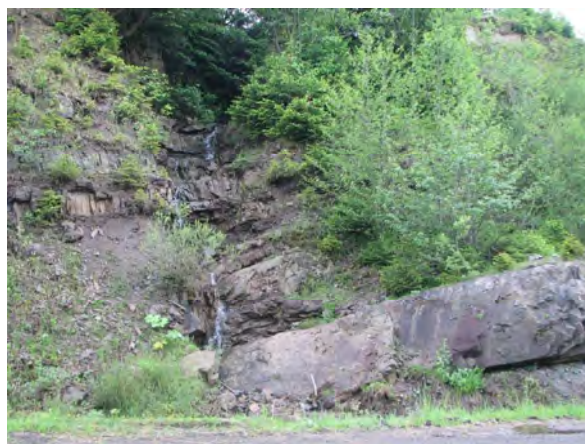
Fig. 4. Dark to black flysch of the Soimy Formation of the Silesian Nappe. Repinka River, near the village of Repinke, Rika River Basin

Silesian Nappe. Eocene black-shale Soimy Formation are developed here. Its lower contacts are cut off by the faults, and the upper ones are expressed by a gradual transition to the Oligocene Menilite Formation. Near the village of Soimy in the Rika River Basin, the Soimy Formation is composed of dark to black medium-rhythmic flysch (medium-grained turbidites) with thick layers of quartz sandstone (probably grain flow deposits) in places (Fig. 4). Thin-layered and homoheniuss argillite intercalations are present and indicate the (hemi) pelagic origin of these intercalations. Argillites are dark-gray, dark-green and black, moreover black ones dominate.