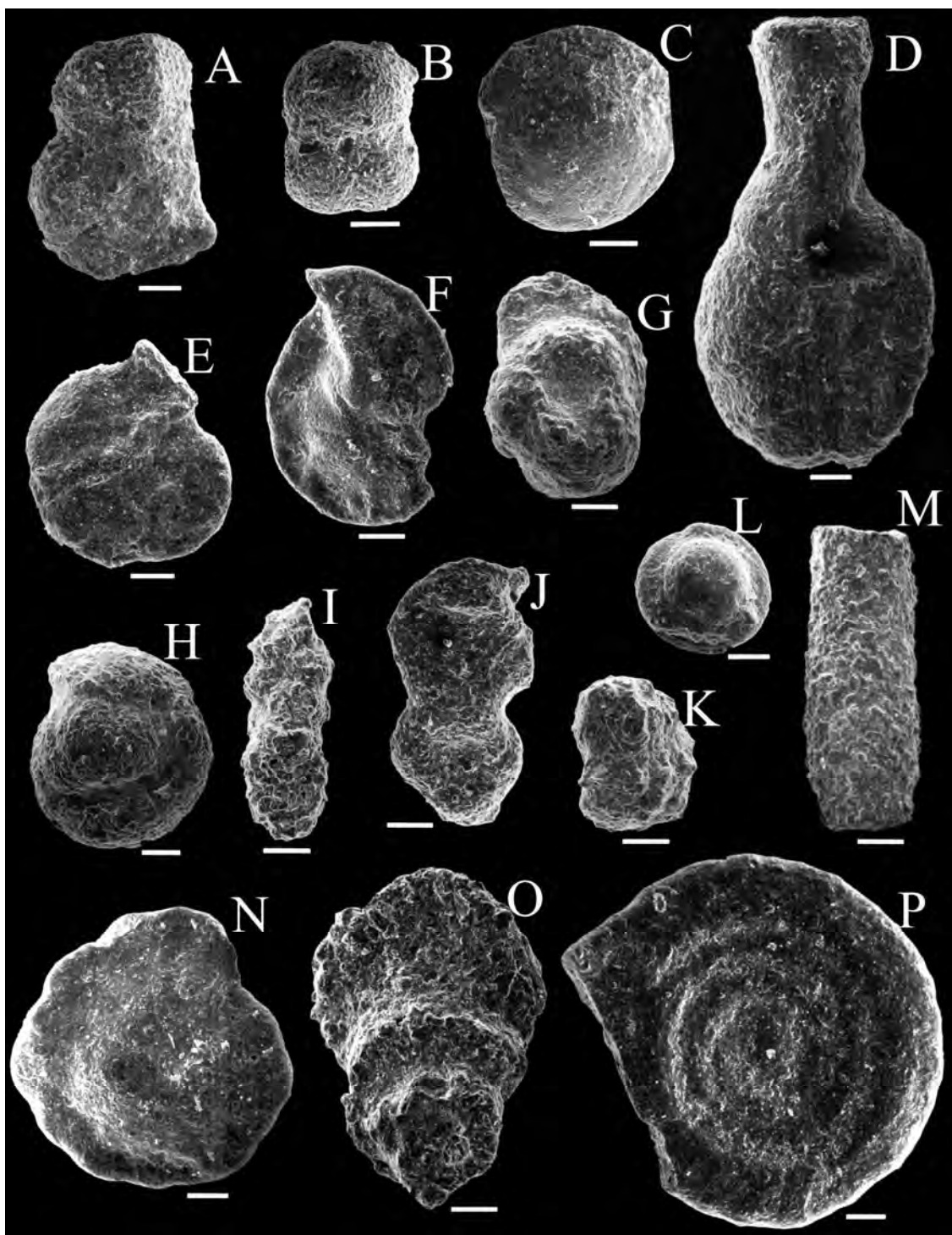
Fig. 7. Characteristic foraminifera in the studied sediments.

A–C – Paleocene (P4 Zone) calcareous species from olistolith of the Volosyanka Olistostrome: A – Globanomalina pseudomenardii (Bolli); B – Subbotina triloculinoides (Plummer); C – Oridorsalis umbonatus (Reuss) (Sample 016). D–P – Latest Paleocene – Eocene deep-water siliceous species from the Soimy Formation: D – Lituotuba lituiformis Brady; E – Trochamminoides folium (Grzybowski); sF – Haplophragmoides walteri (Grzybowski); G – Recurvoides varius Mjatliuk (Sample 2009-20); H – Recurvoides nucleolus (Grzybowski) (Sample 2009-107); I – Karrerulina conversa (Grzybowski) (Sample 2009-102); J – Subreophax scalaris (Grzybowski); K – Recurvoides smugarensis Mjatliuk (Sample 2009-106); L – Glomospira charoides (Jones and Parker) (Sample 2009-3); M – Rhabdammina linearis Brady (Sample 2009-100); N – Reticulophragmium amplectens (Grzybowski); O – Reophax pilulifer Brady (Sample 2009-103); P – Ammodiscus latus Grzybowski (Sample 2009-101). Scale bar 100 \mu\text{m} .