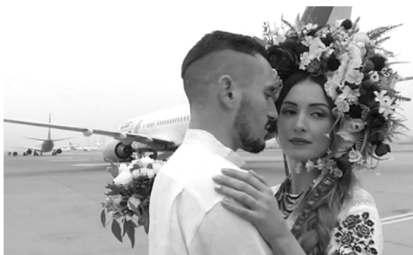
Fig. 1. Marriage at Boryspil Airport, Kyiv [38]

It is worth concentrating on the main motivating basis of this type of urban structure, which is easy access to a large selection of life opportunities. In that case, both components of this dichotomy are inversely proportional, which means that the easier accessibility tends to as much choice as possible, and the biggest choice wants to be easiest to access. In this context, the new urbanistic reality forms itself, the process of which does not depend on the environment in which it occurs. In other words, the potential of dichotomy (accessibility-choice) is capable of transforming any already existing urban objectivity, which has developed in previous historical periods as a result of different conditions. The main instrument here is the market response mechanisms for the proposal, which increasingly acquires the structure of the “wide choice” and pushes transforming of the surrounding areas towards the relevant to it (“wide choice”) principle of mixed use [14].