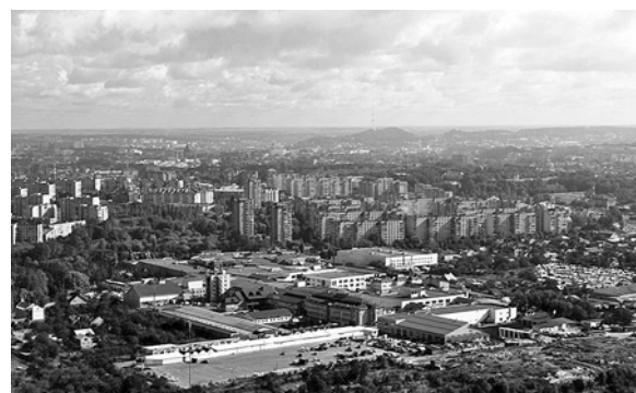
Fig. 2. Market “Pivdennyi”, Lviv [29]

The contrast between the two methodological tendencies can be illustrated by the facts that the society uses some objects with purposes which are not related to the actual functions of the past economic formations, but were erected recently and in accordance with the actual needs of the city. An example of this development could be the use of the Boryspil airport in Kyiv as a hall for wedding ceremonies, which began in 2017 [38] in a