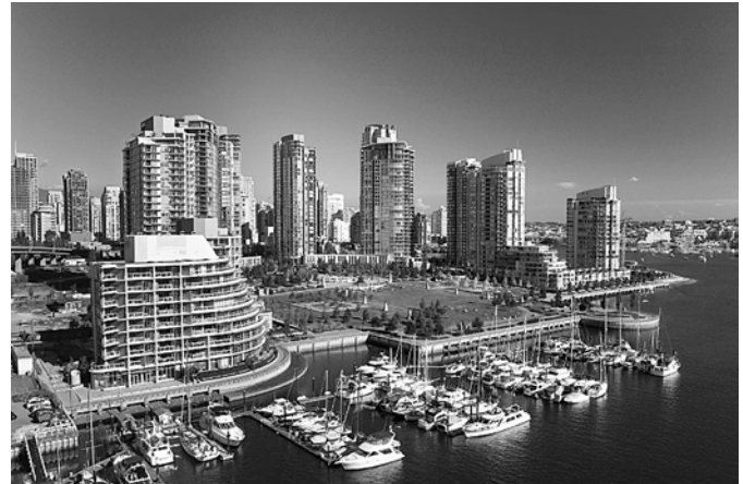
Fig. 4. “False Creek” district in Vancouver [39]

Based on this kind of practical experience, which showed the limits of the possible achievement of optimal density without loss of quality of residence, a certain consensus was established regarding the indicators of the desirable number of inhabitants resettled per unit area: 100–120 habitats per hectare, primarily in areas adjacent to the major transport routes, or in the end it is possible to bring the maximum figure of 10.000 inhabitants per square kilometer [15, 18, 27, 23].