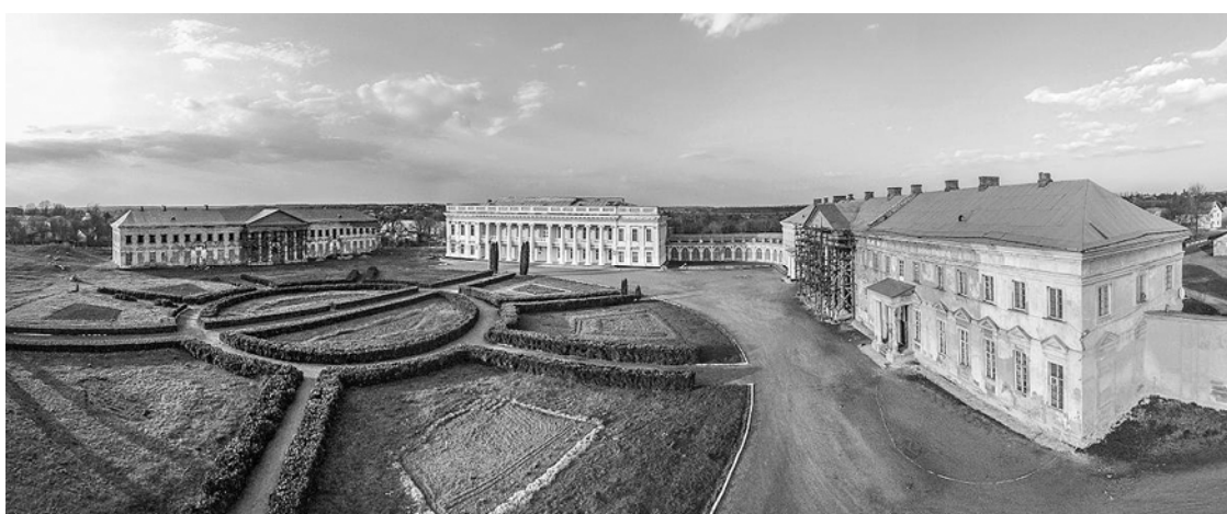
Fig. 1. The Pototskyi Palace in the town Tulchyn. Photo by M. Rytus (2017)

The historic preconditions of creating the palace ensemble in Tulchyn trace their roots to the 15 th century. Modern Tulchyn is a district center located in the south part of Podillia Plateau, 82 km from the region center of Vinnitsia. The town came into being in the 15 th century in the territory that at first constituted the Grand Prince Land Fund of Lithuanian state (Setsinski, 1911). The Polish historians of the 17 th century assume that this settlement had the name of Nestervar and was built on the bank of the river Silnitsia. The main and the first mentions of this settlement date back to the early 17 th century, the time of its belonging to the major Polish magnates Kallinovski by which the castle and a wooden Catholic church were erected (Krzyżanowski, 1862). Due to Zboriv Agreement signed in 1667 Nestervar was added to Cossack regiment of Bratslav Voivodeship, and after Andrusiv agreement signed in 1667 joined Polish-Lithuanian Commonwealth (Guldman, 1901).