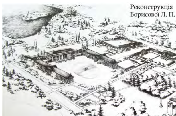
Fig. 4. Estate reconstruction (Borisova, 1974)

The pediment tympanum of the eastern and western wings was filled with a high relief heraldic composition and weapon attributes included ancient torsos wearing the cuirass and the helmet with count crown flanked the weapon and prolonged shields (Fig. 5). The latter contained the monogram of the letters “SP” meaning Stanislav Pototskyi. From the side of accessed road the shield of the tympanum have the family arms: to the left – “Pilawa” of Pototskyi family, to the right the fan of seven ostrich feathers – the arms of the Mnishek family (Lobko, 2008).