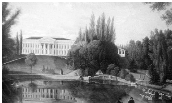
Fig. 6. Park. Watercolor. Early 19 th century