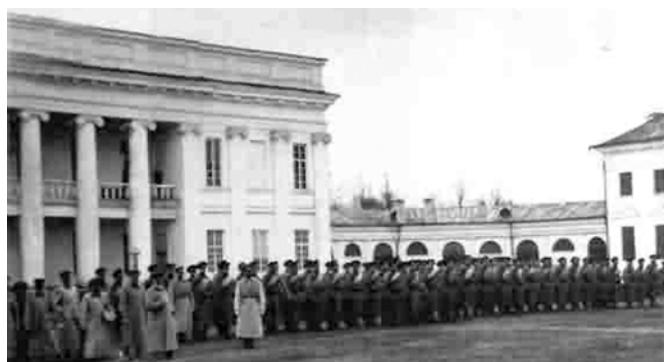
Fig. 7. Photo of the palace in 1912