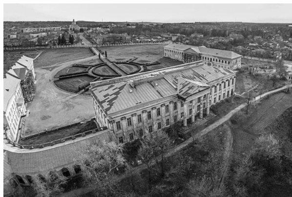
Fig. 5. Main axis palace-cathedral”. (Rytus, 2016)

The problem of sewerage and heating systems in the palace was solved in up-to-date way. The water closets had to be situated in a middle part of the main building as well as in the three places of the wings. The vertical canals joint with the horizontal ones led up to the ground floor of each building under the floor. Further canals connected them with the reservoirs hidden in the ground at the bottom of the garden. The heating was provided due to the canals placed in the inner walls of both floors. Apart from the marble fireplaces, which gave only inconsiderable increase in temperature, some premises of the palace contained the stoves. Several such stoves had been preserved yet to the postwar period (Rolle, 1864).