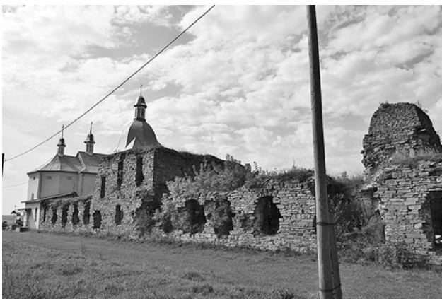
Fig. 1. Transfiguration Monastery in Pidhora village. Photo 2017

All supplements of losses in the masonry of building mortar, stone, splicing of cracks must be performed by solutions, similar in composition to the authentic (lime and sandy solution).