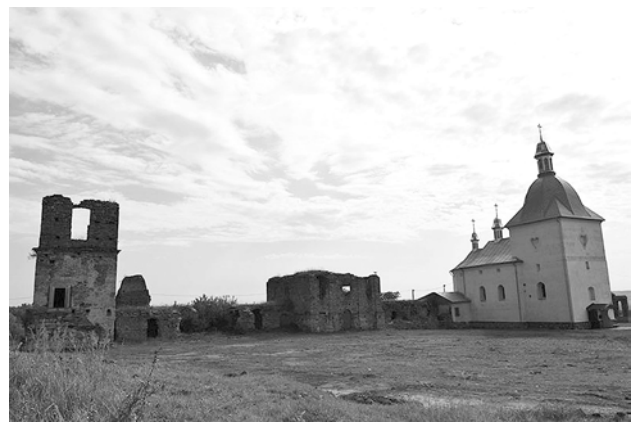
Fig. 2. Transfiguration Monastery in Pidhora village. Photo 2017