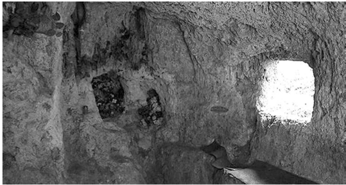
Fig. 6. Ruins of the monastery cave-cell churches in Ulashkivtsi. Photo 2014