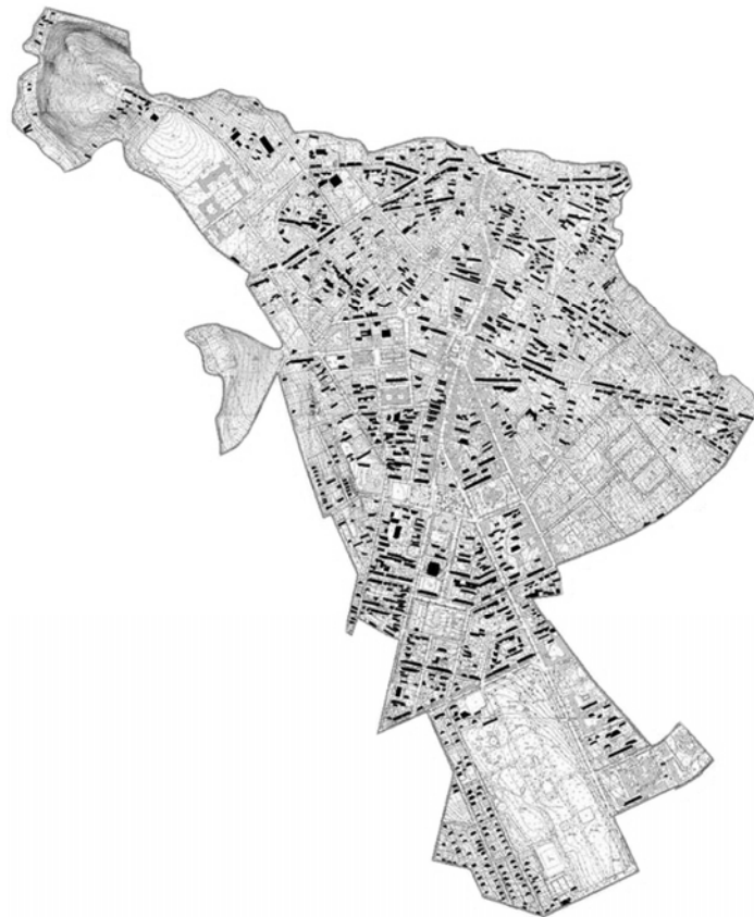
Fig. 4. The fragments of south oriented roofs of buildings, included in the monitoring