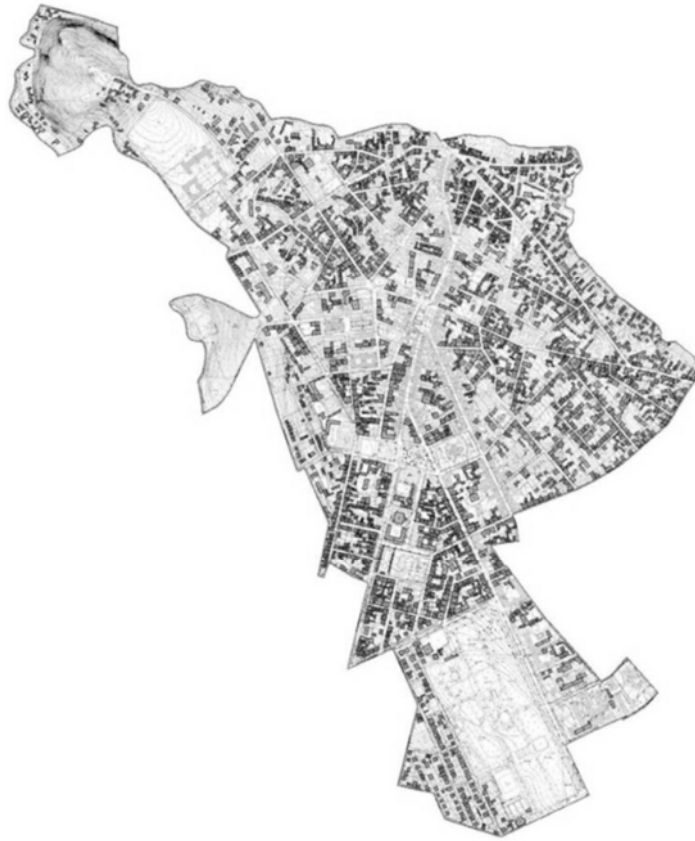
Fig. 3. The buildings included in monitoring