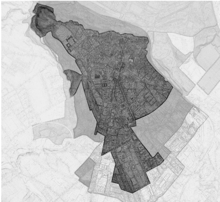
Fig. 1. Complex protective zone of Chernivtsi within a central historic area