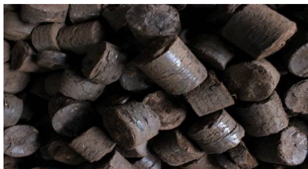
Fig. 2. Fuel pellets

Fuel pellets of lignin are high-quality fuel with calorific value up to 5500 kcal/kg and low ash content. During combustion the lignin pellets burn with colorless flame, and do not effuse soot of fume. Main physico-chemical properties of fuel pellets made of lignin are given in table below.