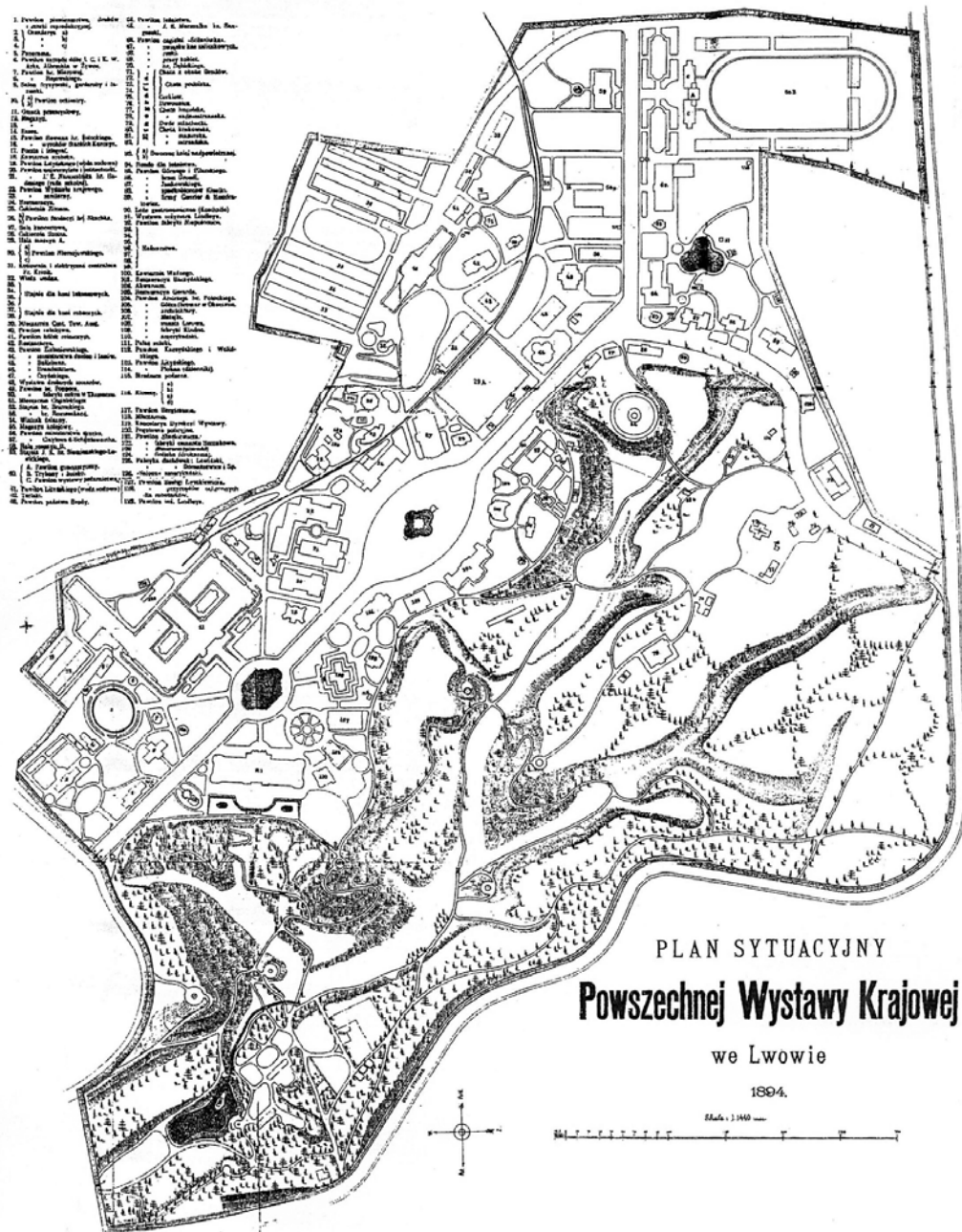
Fig. 1. Master plan of the Kilinskyj Park (Stryjskyj) – the General regional exhibition in 1894, Archived photo

monument of Y. Kilinskyj” (1983), “Major repairs of water cascade” (1985–1987), and the “Small belvedere with a central glade” (1986–1987), reconstruction of wayside-travelling network and main avenue of overhead terrace.