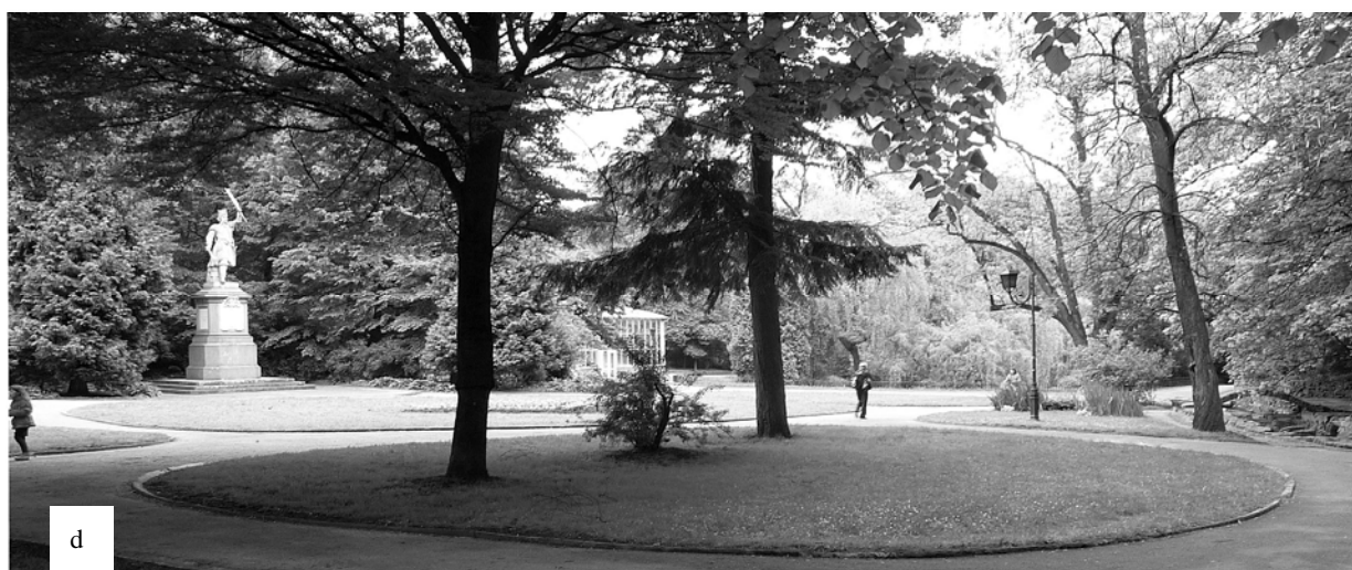
Fig. 3. Views of grass ovals in front of the Jan Kilinskyj monument in the Stryjskyj park in Lviv: a – lower parterres designed by Arnold Röhring, 1894; b – the same parterres in 1980th; c – the project restoration project and its realization in 1983–1989. Architects T. Maksymiuk, B. Kravtsov, V. Didyk [1]; d – a prospect of central parterres in 2016.