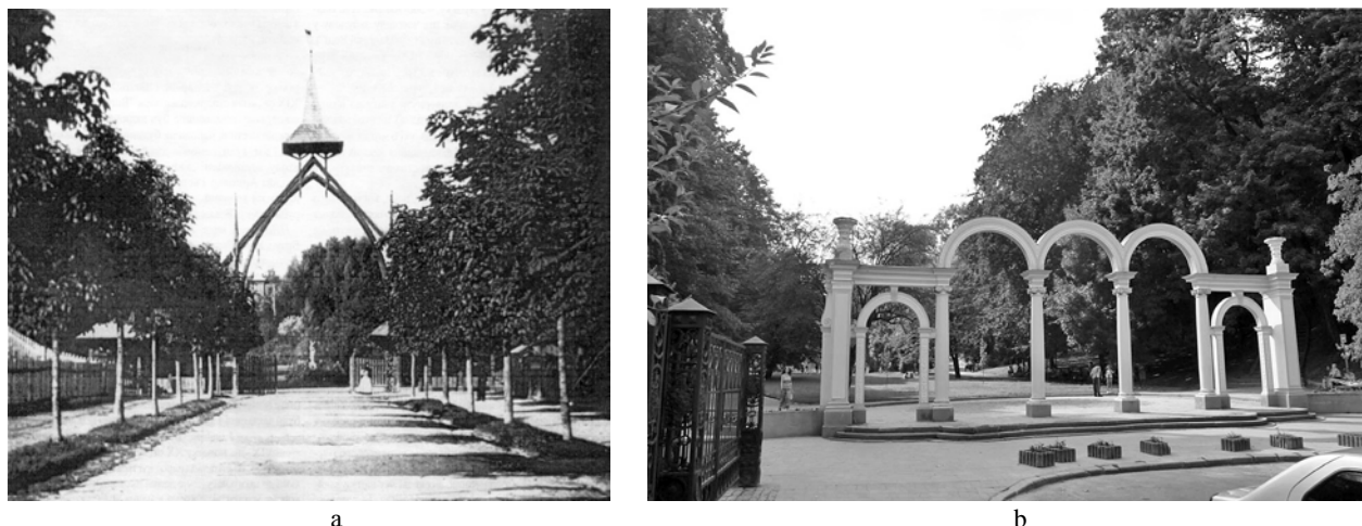
Fig. 2. The Entrance to the park – wooden arch of architect A. Zacharievycz (archived photo) (a); the entrance area to the Stryjskyj Park – modern arcade of architect G. Shvetskyi-Vinetskyi, built in 1952 (b)

Reconstruction plan of Stryiskyi Park was agreed at all levels, including the level of the State Construction Committee of Ukraine and the National Committee for Conservation of Nature and monuments of landscape architecture (1986). It included the reconstruction and restoration of the lower gardens of Stryiskyi Park, the construction of water cascade, a small Belvedere, rosary and the main avenues in the upper terrace.