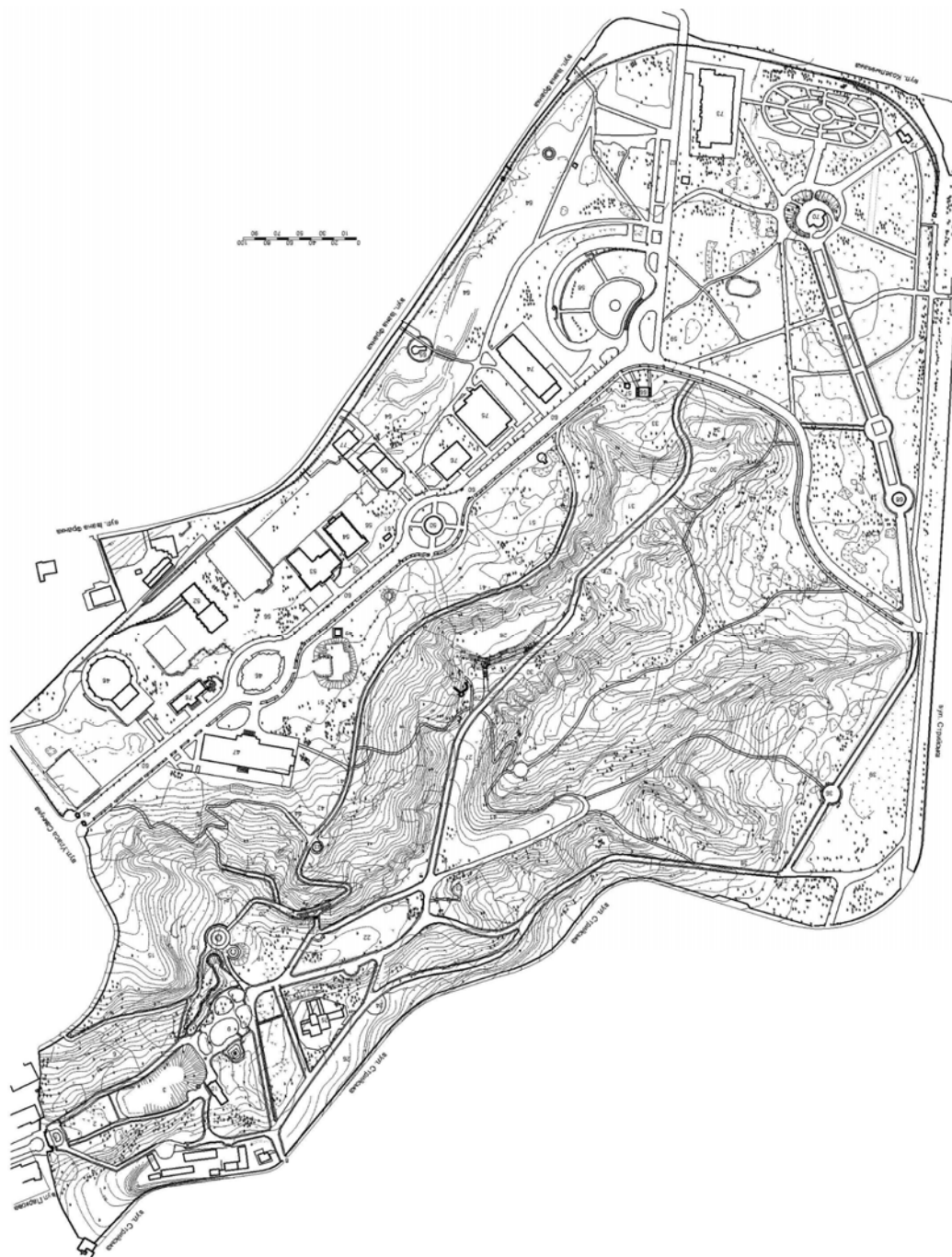
Fig. 5. The Master plan of Stryjskyi Park reconstruction, in 2010 (architects T. Maksymiuk, V. Didyk and S. Tupis).

According to the classification of areas and objects reserve fund of Ukraine, Stryjskyi park in Lviv is monument of landscape art of national importance and is protected as a national property, for which a special regime of protection, reproduction and using is established.