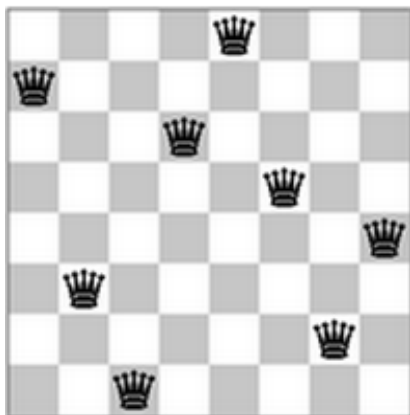
Fig. 2. Task solution for N=8

Solution to a task is a tuple of a size N , where index is a row, in which the queen is located, and value is a number of columns. For example, for N = 8 the solution is (4, 0, 3, 5, 7, 1, 6, 2), as shown in Fig. 2.