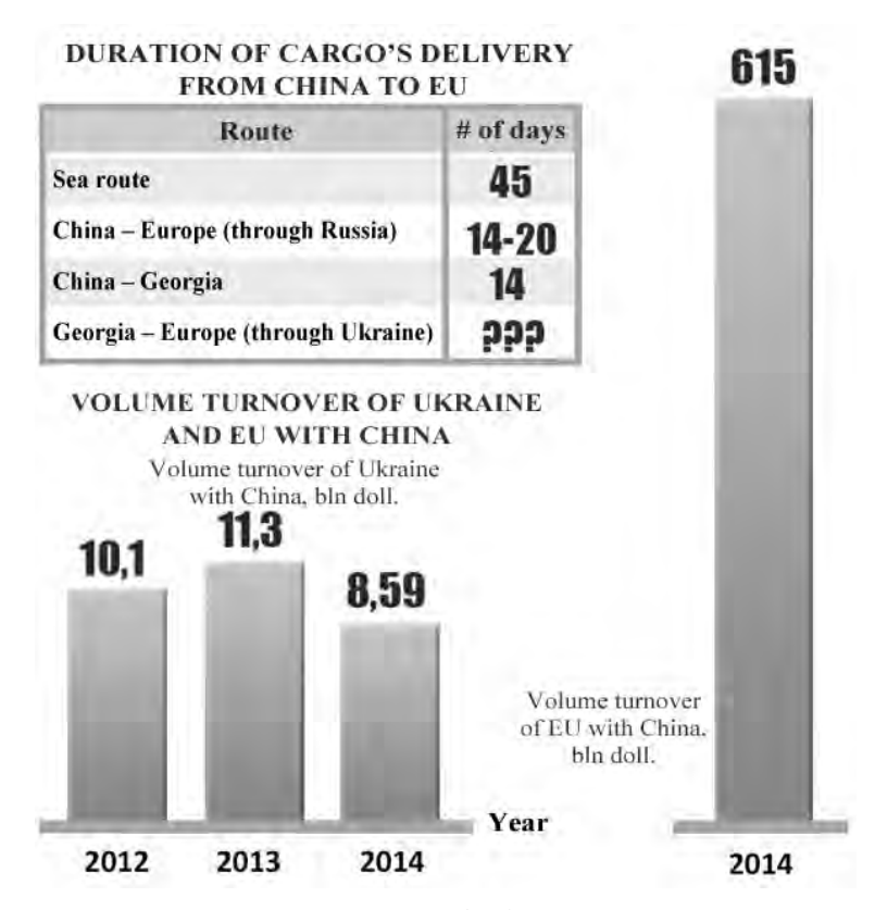
Fig. 1. Duration and volume turnover

However, the existing sea routes, their high dependence on weather conditions and the duration of cargo delivery is not a competitive point comparing with the delivery of goods through the territory of Russia. Due to this at the beginning of 2016 was launched the project of a new direction "Silk Road" (fig. 2). From Illychivsk was sent a half-empty train with 10 wagons and containers for the purpose of analysis of all risks and duration of the planned route. The duration of the trip had to be 11 days (versus 45 days – by the sea, and 14 days for the route: Georgia-China). Despite the declared duration – the goods reached the final destination in 15 days and until present days (October 2016) stands in China. Despite the alleged perspectives, short time delivery and ease of implementation (the distance of cargo delivery could be reduced and infrastructure facilities of all countries has working status) the project has not received support in the business.