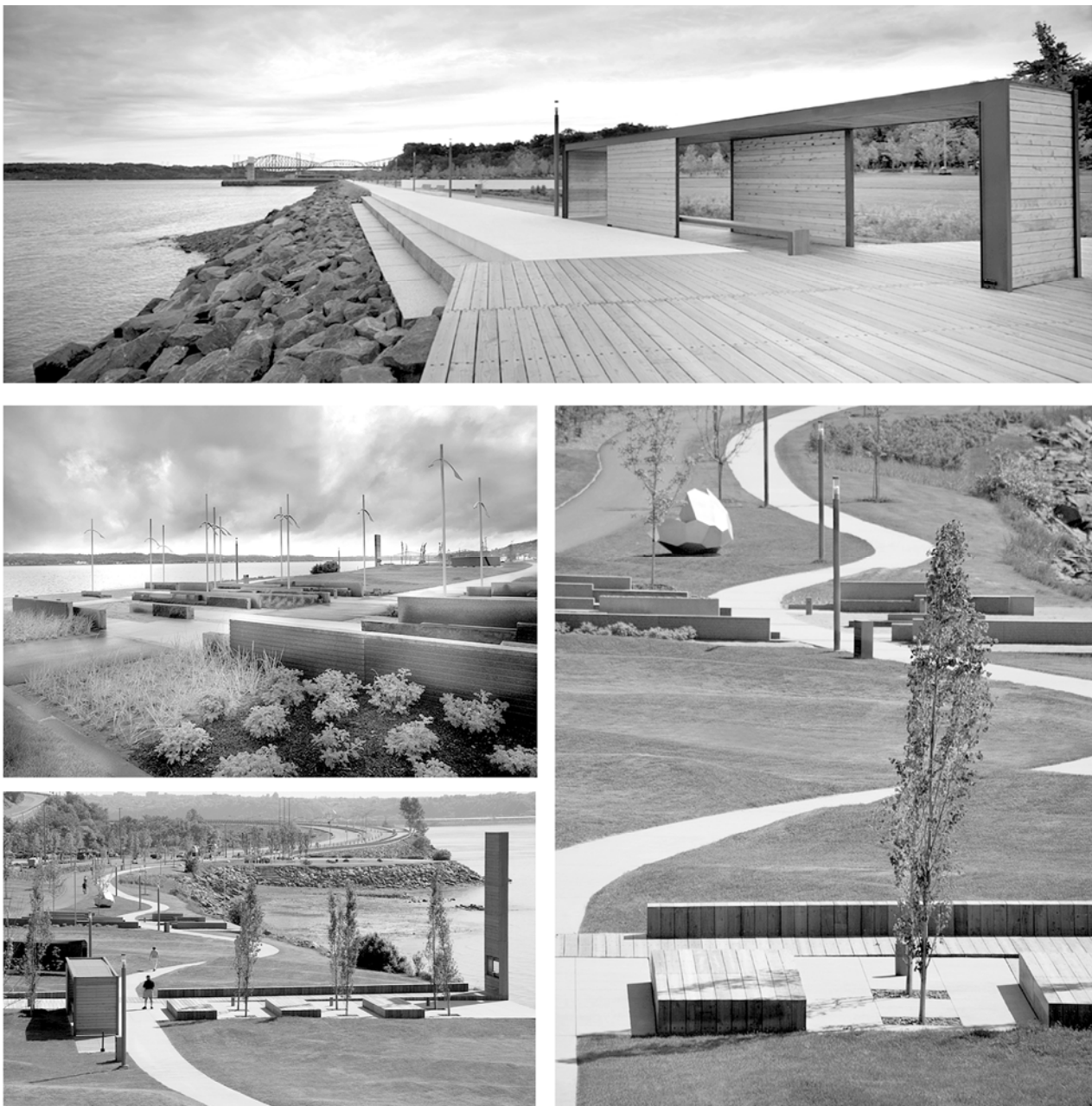
Fig. 2. Design SpaceCity waterfront, 2008.

In the second half of the twentieth century, due to the development of industrial design, the situation in the realm of the objective urban spacesfilling began to change radically. Instead of veneer boardwalk kiosks and telephone booths “artisanal” the industrial production forms of telephone boxes, vending machines and multifunctional space modules were introduced using the latest, at that time, materials and technologies, and in consequence of it the archaic small architectural forms were replaced by modern outdoor furniture and equipment. That is why a patio furniture became less massive and heavy. This was due to the properties of the new forms of subject as mobility and variability. At that, the design of industrial objective forms didn’t contradict the principle of architectural ensemble, but in case of a successful design promoted the composition, stylistic and semantic preservation of a spatial ensemble holistic structure, its reinforcement, and, sometimes, allowed to form it anew. A brilliant example a pedestrian streets design can be historic center of many European cities (1970–1980 s), where the street furniture and elements of visual communication together with a coloristic decision and landscaping improvement formed an original street style (corporate identity) as a unique spatial ensemble worth remembering. This became a revolutionary moment in the history of the management of city object-spatial environment.