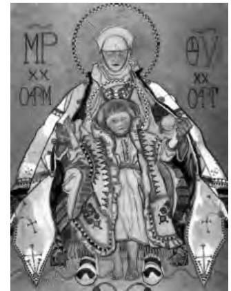
Fig. 4. Central part to Triptych Gutsul Madonna, 1914. Cazymyr Sikul'sky