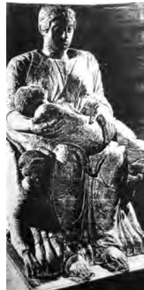
Fig. 3. VI–VII century B. C. Etruscan* Madonna Goddess of dawn, married couples, procreation