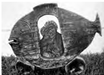
Fig. 5. Mykola Telighenko – Chumack Madonna