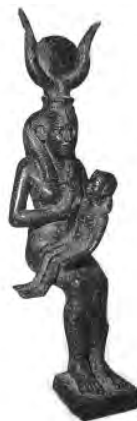
Fig. 2. Isis with Horus in her arms 2 300 years B. C.