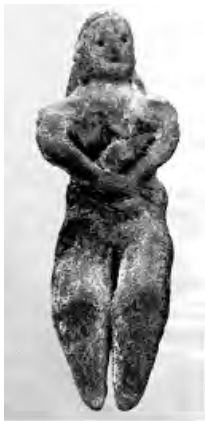
Fig. 1. Settlement Krynchka. Prehistoric Madonna of Trypillya V–IV Millennium B. C

Phenotype is the "ambitious gene" [13] in the individual. Phenotype is outer expression of archetype and genotype, but unlike archetype and genotype, it does not demonstrate everything. Archetype and genotype are more resistant to changes than phenotype. Genotype demonstrations of archetype in word, on the one hand, and phenotype demonstrations through the figure, on the other, are ends of a single process of realization of genetic information in individual creative work. In comparison to comparative mythology (world outlook from the inner world) of the individual soul, the archetype's development-transformation possesses metaphorical and significant symbolic figures, which is demonstrated both in genotype, and in phenotype.