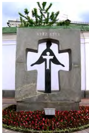
Fig. 6. Kyiv, Mykhaylivs'ka square. 1993, V. Pereval'sky Holodomor Madonna