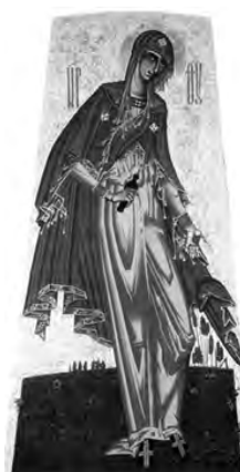
Fig. 7. Chornobyl' Madonna. 1992 p. M. Bidnyak