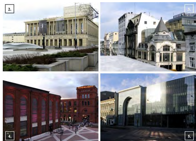
Figs.2-5 The „big four”: the most recognizable cultural places of Lodz, Poland: Grand Theatre (2), Piotrkowska Street (3), Manufaktura Centre (4) and Philharmonic Hall (5).

Another conclusion drew is that most recognizable events are at least partially reflecting the local specificity of a place (Fig.6). Four Cultures’ Dialogue Festival mentioned above refers directly to the multicultural past of Lodz, Rubinstein Piano Festival recalls the place of birth and education of one of most famous virtuoso, Film Music Festival is organised by most recognizable film