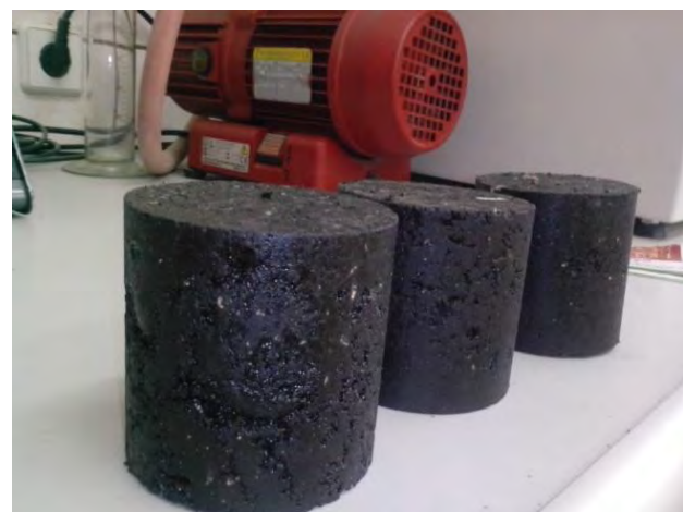
Fig. 2. Photograph of the samples