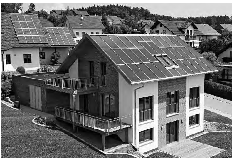
Fig. 1. Solar panels form the plane of the roof [9]

Presently such elements are eg. solar panels (Fig. 1) and solar roof tiles (photovoltaic tiles) (Fig. 2.) which due to their shape do not disturb the current construction methods and traditional form composition of buildings.