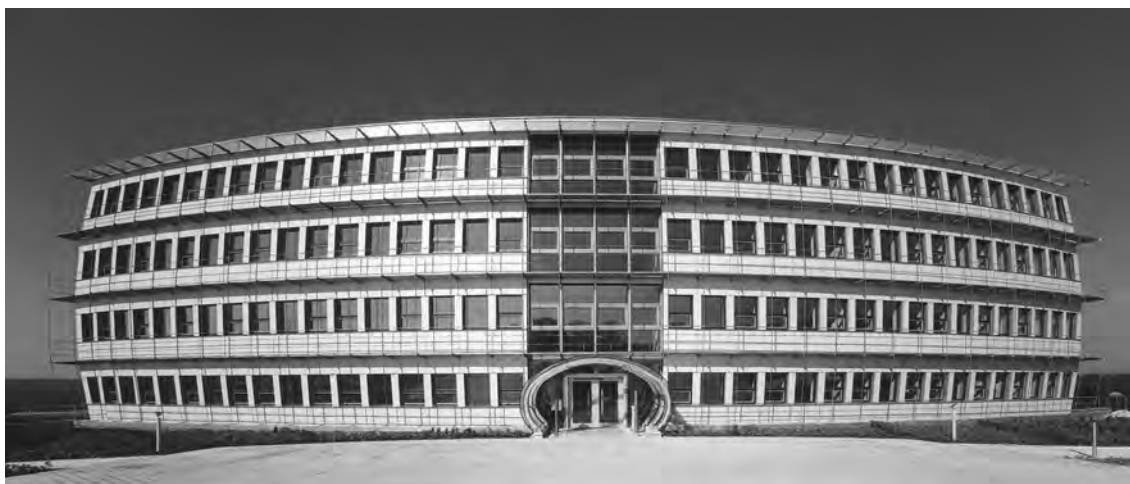
Fig. 5. Energon: smart passive office building in Ulm, area 6000 sq ft, Germany. The front elevation. [17]

Of particular interest for our topic is a building that is passive and intelligent at the same time. It was built in 2002 in Germany in Ulm as the largest passive office building known as "Energon" (Fig. 5, 6, 7). Energon was built on a large strip of land in the middle of a scenic park, surrounded by bodies of water – ponds collecting rainwater from the roof of the building. The building has an area of six thousand square meters. It is a place of work for 420 people. Thanks to the technologies used it consumes only 25 percent of the energy for heating, air conditioning, etc. normally needed in this type building.