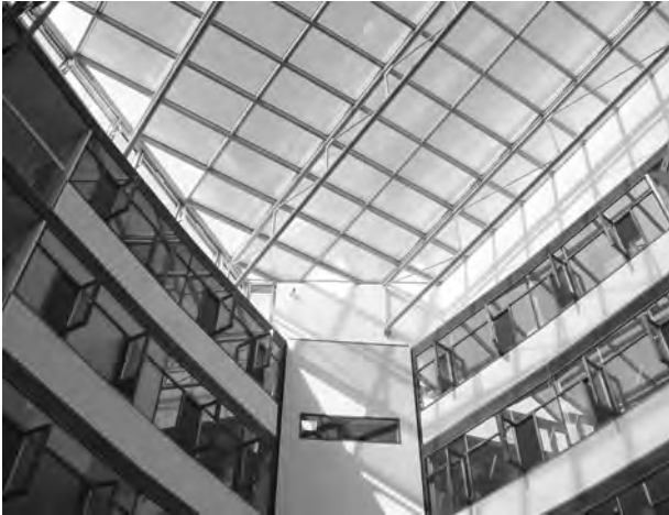
Fig. 6. The interior of a passive office building in Ulm [17]

In this building a large glass roof atrium (Fig. 6) provides a sufficient amount of light in the rooms inside the building which minimize the use of artificial lighting. To maintain a comfortable temperature, the passive building in Ulm uses an intelligent air conditioning system.