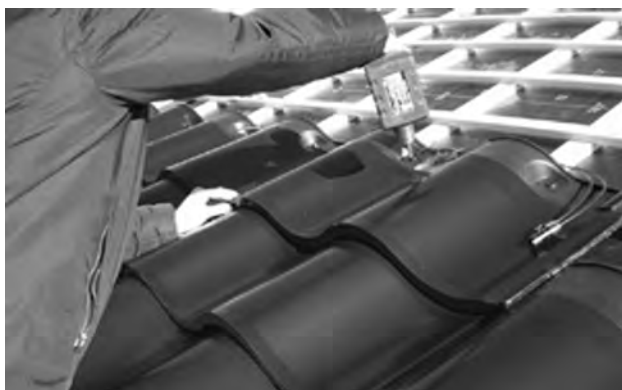
Fig. 2. Roof tiles with integrated solar photovoltaic cells [10]

For example, a solution that is fully integrated with traditional form of a building was proposed by scientists of the Massachusetts Institute of Technology MIT. They have developed a technology called Thermeleon which is a photovoltaic roof tile able to change its color automatically. (Fig. 2, 3).