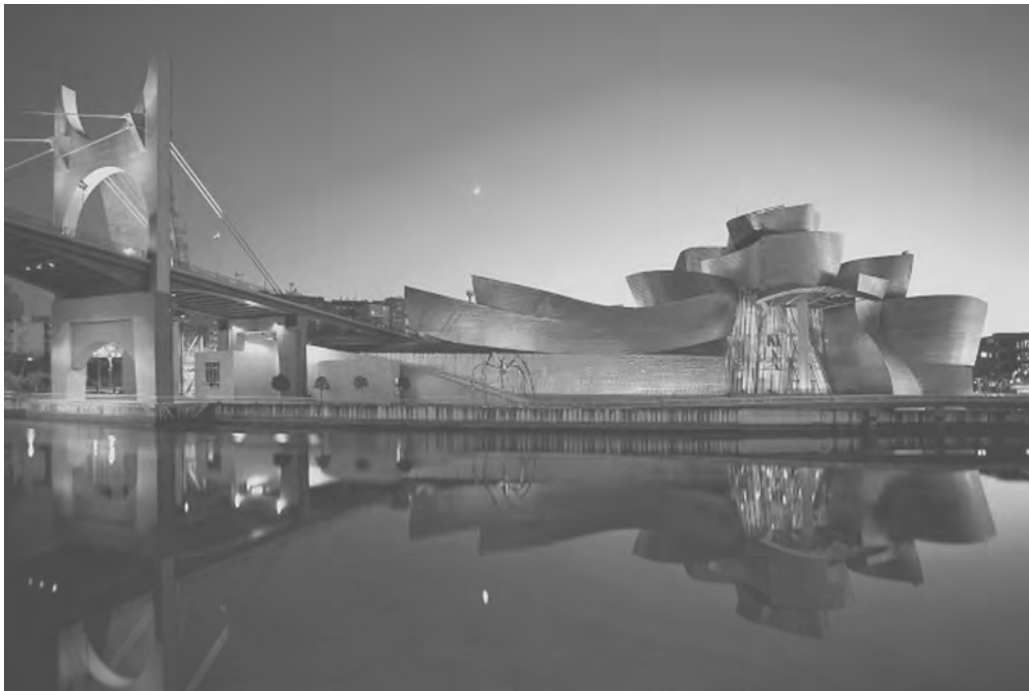
Fig. 8. The Guggenheim Museum Bilbao is a museum of modern and contemporary art, designed by architect Frank Gehry and located in Bilbao, Basque Country, Spain [18]

Contemporary architecture is a common demonstration of possibilities of computer-aided design.