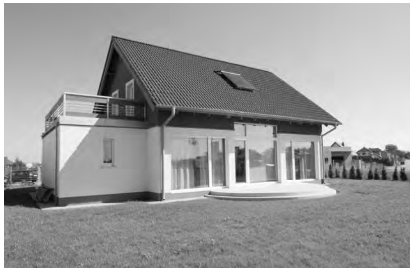
Fig. 4. In Poland, the first demo house certified as passive was built in Smolec near Wrocław by copyright office project Lipińscy The Passive House and developed in collaboration with specialists from the Institute of Passive House at the National Energy Conservation Agency [15]

In a passive house the thermal comfort is ensured by passive heat sources that used to be underestimated. These can be people, electrical equipment, heat from the sun and the heat from the ventilation that is by recuperation.