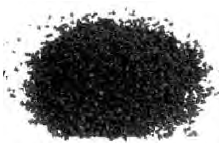
Fig. 1. Sample of ground tire rubber

In the dry process the rubber acts more like an aggregate. Aggregate grading is one of the fundamental properties of aggregates. For the sample of ground rubber supplied by V.O.D.S. a.s. the grading analysis was done. The sample (Figure 1) denoted A was tested.