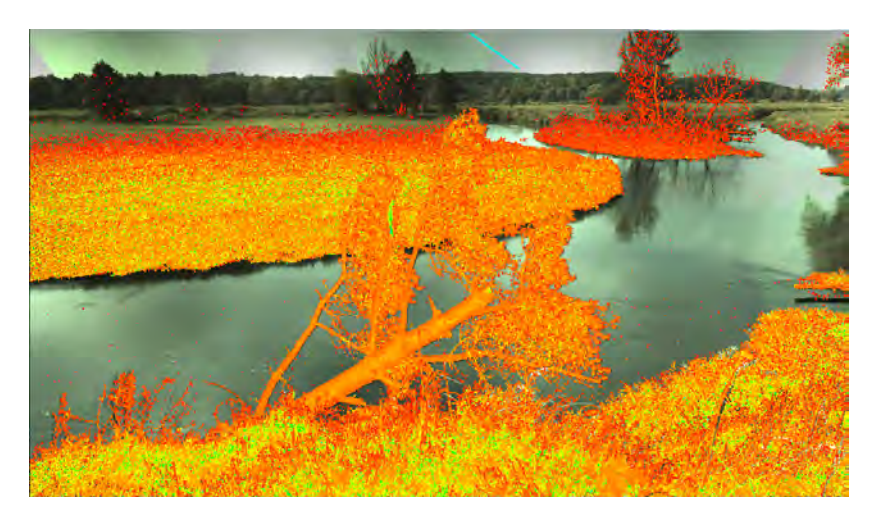
Fig. 2.Graphical representation of measurement in a station JAJKOWO

An example of a 3D model. Potentialities of using geoinformation technologies and terrestrial laser scanning for monitoring of meandering section of the river were evaluated in study in 2012. Results from measurement by means of Scanner Scan Station C10 in a station JAJKOWO, Drwęca river, is presented in figure 2.