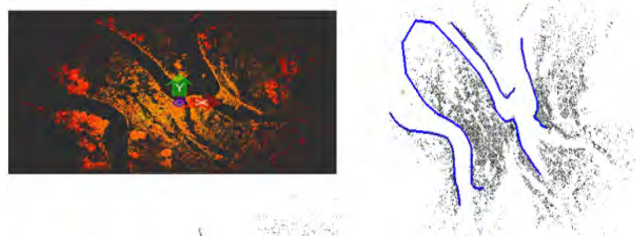
Fig. 3. Point cloud from TLS after the initial filtration (Own work)

Obtaining 3D model from TLS requires a few stages of data processing. One of them is initial automatic point filtration (Figure 3), and then correction in interactive mode.