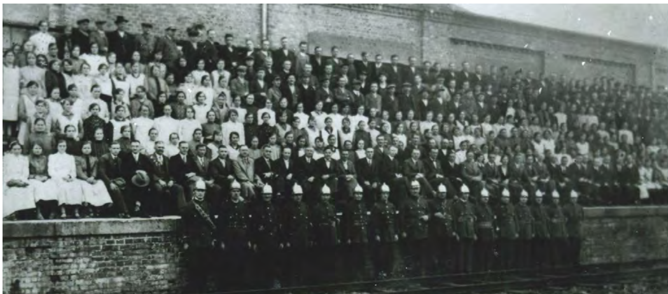
Bierun staff, 1930

During this period Lignoza Co. acquired 24 patents in the United States, Britain, France, Germany, Belgium, Holland, Austria and Finland. Below you will find the full list of the patents, as they are quoted to this day in prior art of 52 foreign inventions, beginning from the fifties and ending with the U.S. patent applications of 2010, and PCT WO 2006. This list does not include Polish patents obtained in the Polish Patent Office in this period.